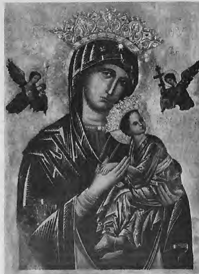
Our Lady of Perpetual Help